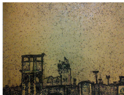
Transition Afghanistan Series, 2008